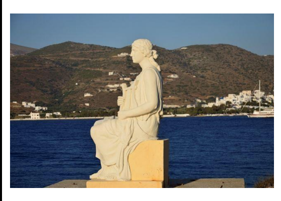
Erato overlooking the sea in island of Amorgos

After the survey we made on the internet, we located the other six statues, since the ninth was destroyed, according to historical data. Specifically, four of them are in Karditsa, from which the two have incorrect names, as we have stated that the true Thaleia statue is Karyes and a statue is named Aglaia, but Aglaia is not a Muse. Finally, the fifth statue is by the sea in Amorgos and the last one is in Thebes.