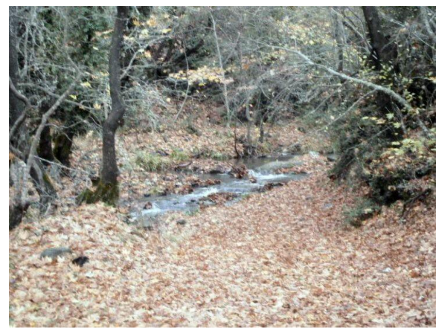
The Church of Conception (Panagia) and the river Deiros